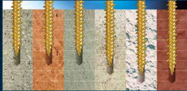
Suggested minimum screw-in depths